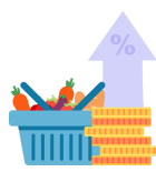
Overpriced food and low financial resources