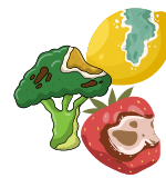
Poor quality food leading to increased food waste

Increased connection and collaboration between government and community is required to support food security in the Midwest region.