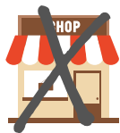
Limited food outlet options