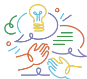
Providing information about food security to the community