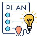
Including community ideas about food security in government plans

We require your support to: Advocate for and/or fund one or more Midwest Food Action Groups, to plan, implement and evaluate place-based, community-led food security activities.