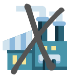
Lack of local food processing facilities