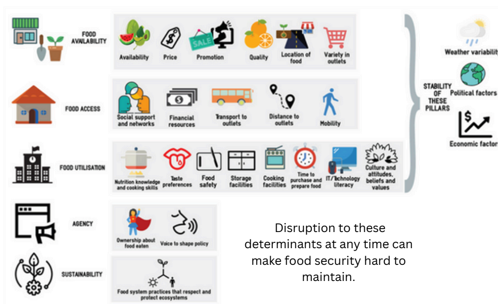
Figure 1: Determinants of food security

Food security occurs when everyone has guaranteed regular physical, social and economic access to healthy and affordable food [1]. This food needs to be of good quality, and in sufficient amounts to meet people’s dietary, social and cultural needs [1]. Community food security refers to sustainable and resilient food systems that provide healthy food that is available to everyone and benefits the local community. Food security is underpinned by six dimensions: food availability; access; utilisation; stability; agency; and sustainability [1-5]. Figure 1 provides a visual representation of the food security dimensions and a range of associated determinants.